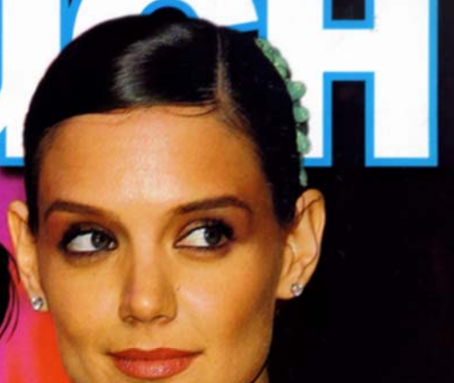
MARY J. BLIGE